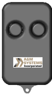
Key FOB P100404